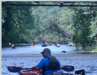
Rally on the River!

When planning your year-end giving, please consider donating to one of our projects: