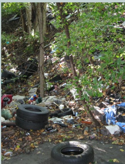
Earth Day Clean Up 2013, Sharon.