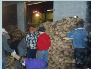
Stacking wood for WaterFire Sharon!