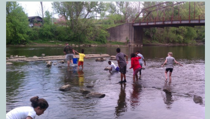
Release of Farrell's Trout from Trout in the Classroom project.