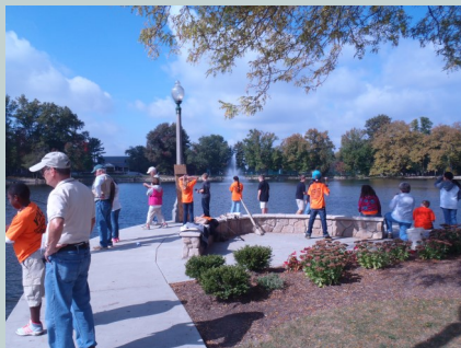
Environmental Education Day,