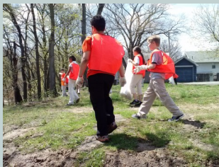
Case Avenue Elementary Earth Day Clean Up