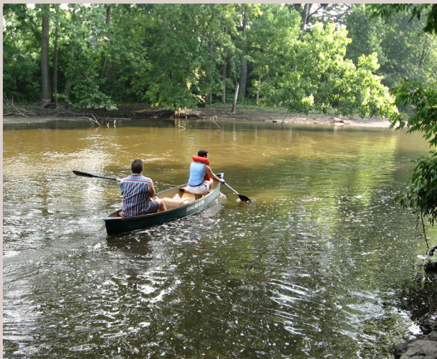
Two volunteers paddle the Shenango River in search of litter

It is a testament to the rapid response of everyone involved that this spill was contained in the manner in which it was. Downstream users did not have to stop water withdrawal from the Shenango River at anytime during the incident. Thankfully, there were no reports of fish kills or other wildlife impacts downstream of the spill and SRW volunteers did not report seeing any oil on the Shenango River.