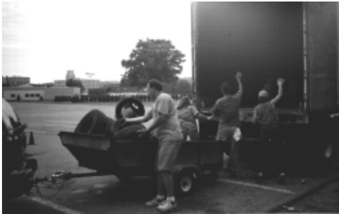
Tire Recycling in Downtown Sharon, July 10, 2004

Our website: shenangoriverwatchers.org also has updated event information. Check it out!